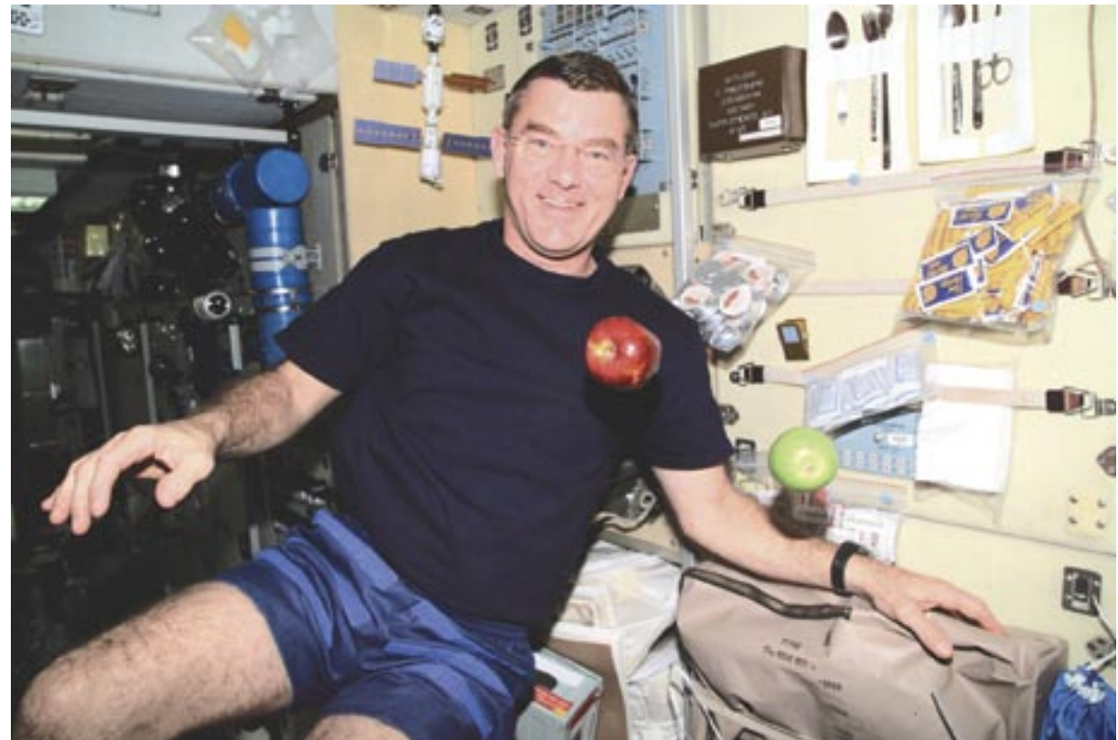
Astronaut James Voss, Expedition Two flight engineer, is deciding between two colors of apples as he takes a break for a snack in the Zvezda Service Module on the International Space Station.

Microcide developed PRO-SAN, a technology comprised of safe sanitizing agents that could possibly be used as an alternative to the two controversial oxidizing agents.