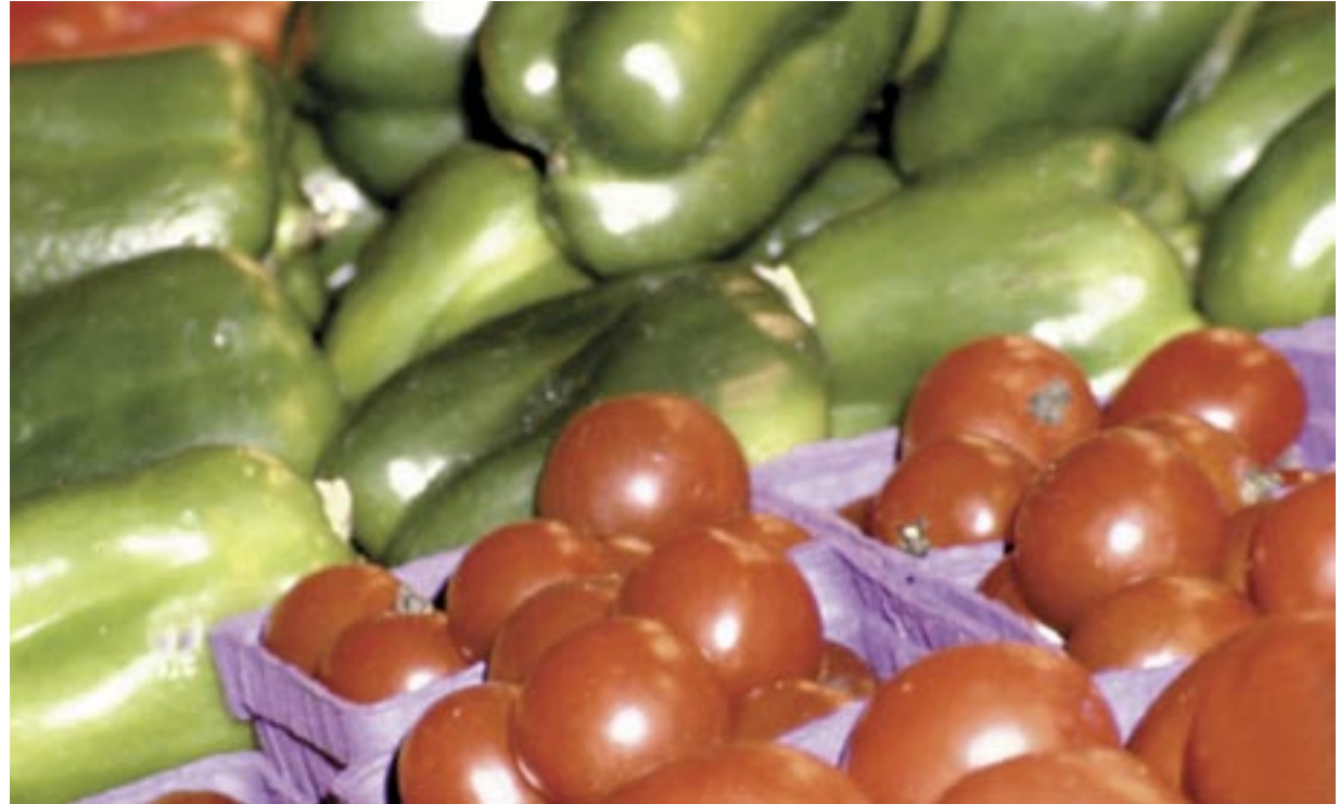
PRO-SAN sanitizing products offer safety from harmful foodborne bacteria, such as E. coli , salmonella , listeria , cholera , shigella , staphylococcus , and streptococcus .

The sanitizer is free of volatile organic compounds, chemicals that have been found to be a major contributing factor to ozone pollution. Simply stated, PRO-SAN does not pollute indoor air in enclosed spaces of homes and kitchens. Also important is that the food-grade ingredients